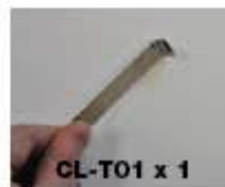
CL-T01 x 1