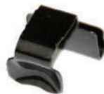
CL-M05 x 4