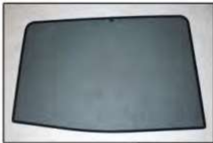
SIDE WINDOWS X2