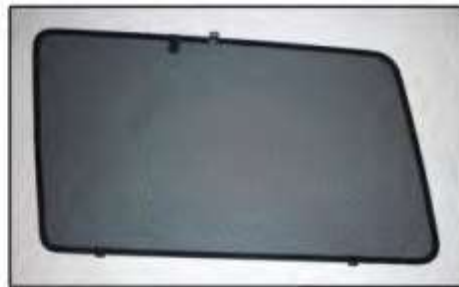
PORT WINDOWS X2