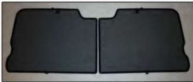
TAILGATE WINDOW X2